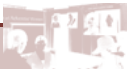
AAAW booth from page 5