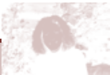
WOYA Nominees from page 5

For more information about PraiseCast, call 805-688-3441.