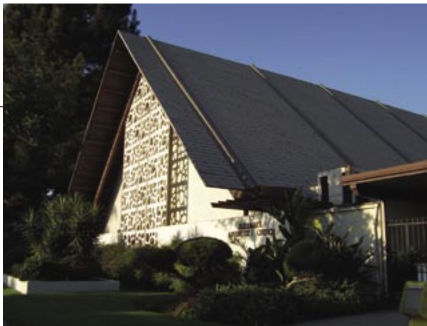
Alhambra Adventist Church—"Grace Place"

I used to have a contemporary service on Friday nights at my old church, and when I was there a company